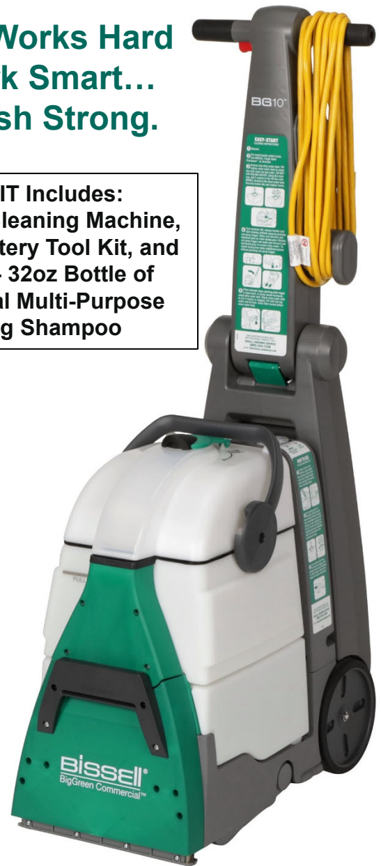
Weights 42 lbs.

BISSELL BIGGREEN COMMERCIAL 100 Armstrong Road Suite 101 Plymouth, MA 02360