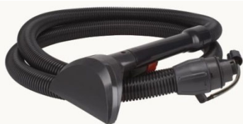
Hose & Upholstery Tool