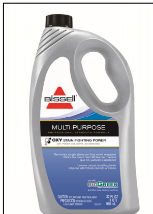
32oz Bottle of Professional Multi-Purpose Cleaning Shampoo